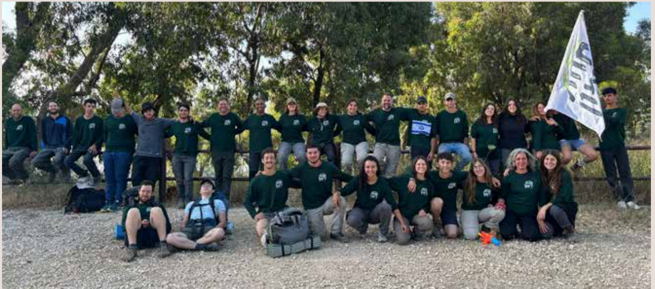
Strengthening youth through therapeutic journeys and building self-sufficiency