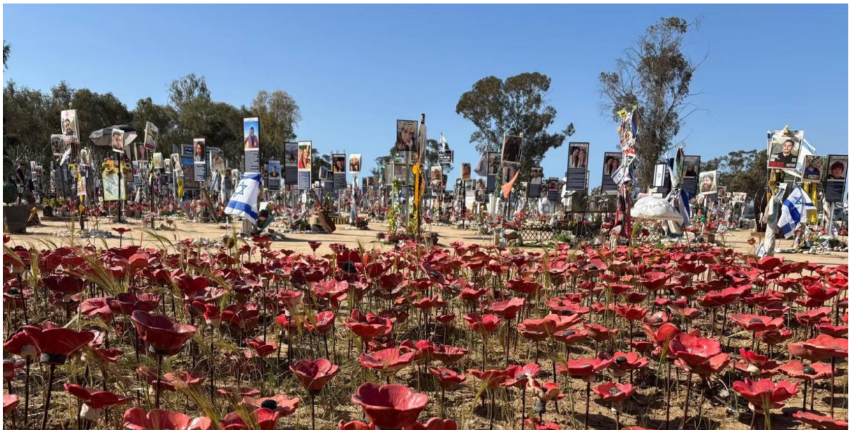
The Nova Memorial April 2025.

And the site next to the Re'im kibbutz, where the NOVA FESTIVAL took place, has been turned into a memorial. This blood-soaked ground, which was covered with around 400 corpses on October 7, still cries out to heaven. No other place where the killings took place on this scale, no other place where people were so defenseless.