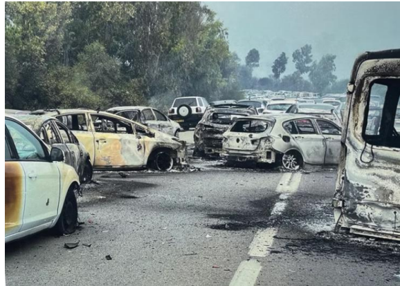
The Nova Festival Site after October 7, 2023. Privat photos of plaques.

A memorial plaque has been erected for everyone who was murdered here, a tree has been planted for each one as a sign of the continuation of life. And when you stand here and see these plaques close together with the pictures commemorating those murdered, when you watch these young, cheerful faces that looked forward to the future with such confidence, you get a faint idea of what a horrific mass crime was committed here. But it is only an inkling.