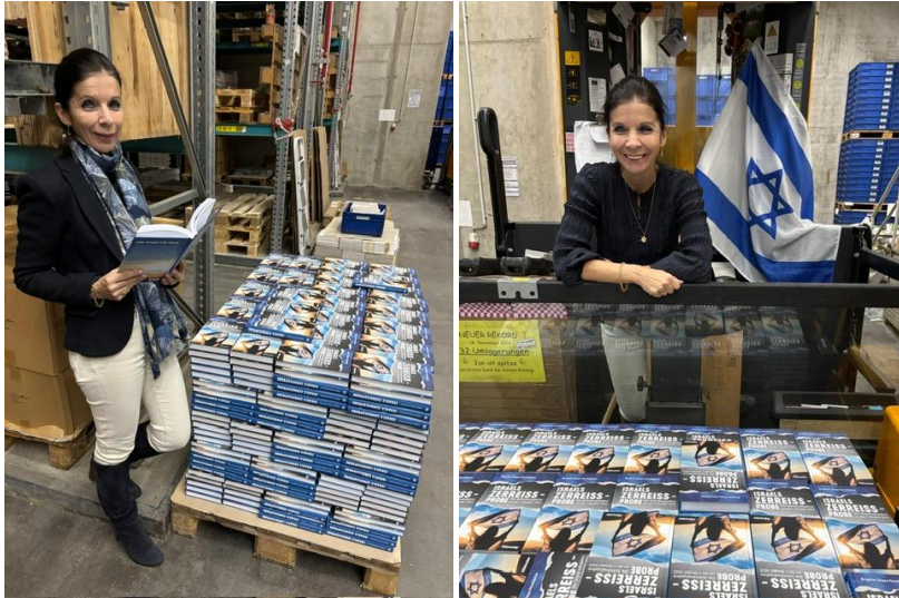
December 10, 2025: The Day the Book Arrived. Private Photos.

But on December 10, I received a call: the finished books had been delivered. That evening, I rushed to the publishing house. There they were - pallets with 3,000 copies. For the first hour, I searched only for potential errors and was overjoyed to find none. Only then did the joy truly break through.