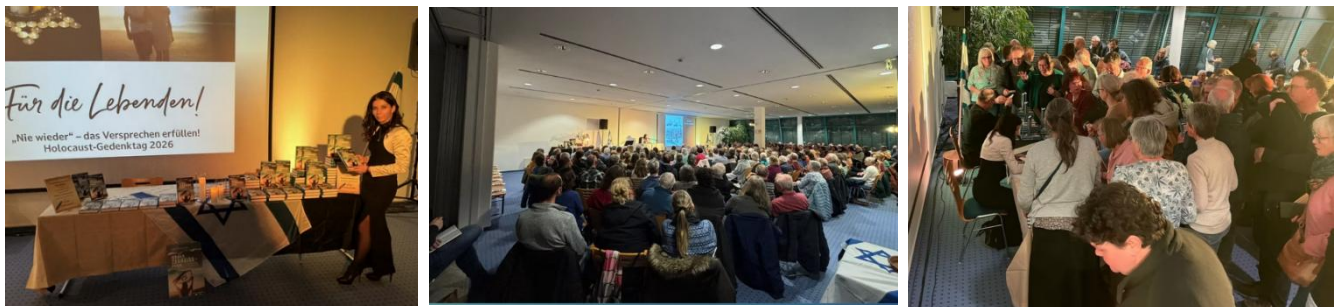
Book Launch – Israel Event, January 2026 – Signing Session.

Nevertheless, in the first days of January 2026, my book left the warehouse and began its journey to readers. It seeks to bring people closer to those in Israel, to give faces to current events, to give space to the voices of October 7, 2023 to show how affected families rebuild their lives from the ruins - and to tell the story of this extraordinary country, marked by miracles.