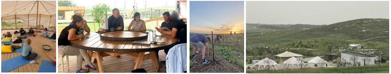
Group therapy // Our visit in April 2025 // Work therapy on the farm // The Rimón Courtyard.

Some of the evacuated families have since returned to their hometowns. But it is no longer the same. Many familiar faces are missing. And practically, much needs to be repaired — or in most cases, replaced — to make the houses livable again. We also have personal connections with these families.