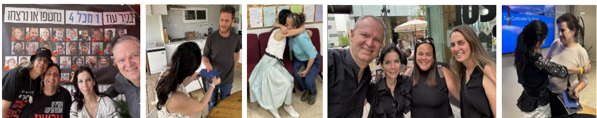
We are passing blessings on to the people in Israel.

Remember the image I shared at the beginning: giving flowers to the living? These are your flowers. Today, this can be your personal way of fulfilling the promise: “Never again!”