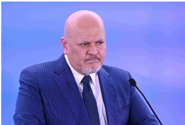
Karim Khan applies for arrest warrants against Netanyahu and Gallant.

On May 20, 2024 , the Chief Prosecutor of the International Criminal Court (ICC), Karim Khan, requested arrest warrants for Israel's Prime Minister Netanyahu and Defense Minister Gallant. He accuses them of war crimes and crimes against humanity in connection with the war in the Gaza Strip. These arrest warrants are actually issued on November 21 and equate a democratically elected prime minister, who led his country to unprecedented prosperity for over a decade, with a globally wanted terrorist and criminal, for whom millions in bounties are being offered.