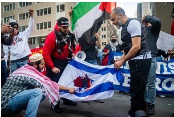
Pro-Palestine and anti-Israel demonstrators during the fighting between Israel and Hamas.

On April 8, 2024 , Nicaragua demanded that the International Court of Justice (ICJ) put an end to German support for Israel on the grounds that it was “aiding and abetting genocide”. Between 2019 and 2023, Germany was Israel's second-largest arms supplier after the USA. Germany was able to plausibly demonstrate that 98% of the deliveries were only general armaments, such as helmets or protective vests, and not weapons of war. Nevertheless, since then and for months, Germany has largely stopped providing military aid to Israel. Only on the anniversary of the massacre and under massive pressure from the opposition parties (CDU, CSU, AfD, FDP) did the German government once again approve arms deliveries to Israel.