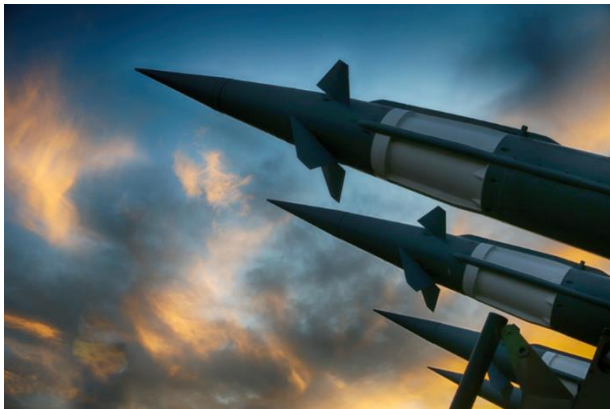
Israel is exposed to countless rocket attacks.

Hezbollah has fired dozens of rockets at Israel from Lebanon every day since October 8, 2023! Almost all of the population of the northern region of Israel (over 110,000 people) had to be evacuated as a result and has been living in temporary accommodation for over a year, internally displaced in their own country. But for the world, this intolerable situation seems quite normal. In any other country, such attacks would certainly have led to massive international backlash and consequences! It was not until September 2024 (after almost one year!) that Israel began to take massive action against these attacks.