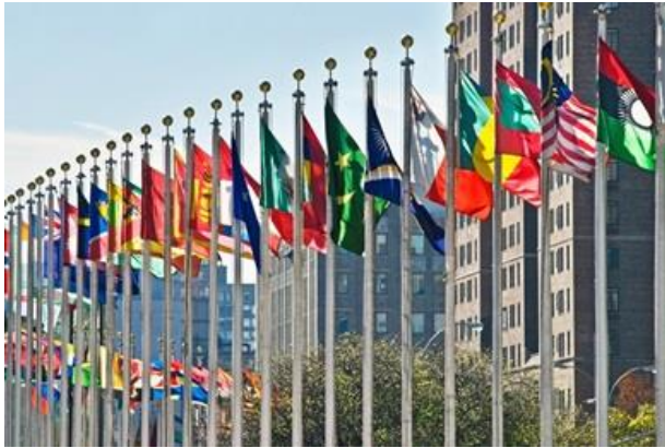
The nations take a stand.

On June 15, 2024 the Group of Seven (G7) members demanded that Israel cooperate with the Palestinian Authority (PA), even though the PA had not condemned or distanced itself from the crimes of the terrorist organizations.