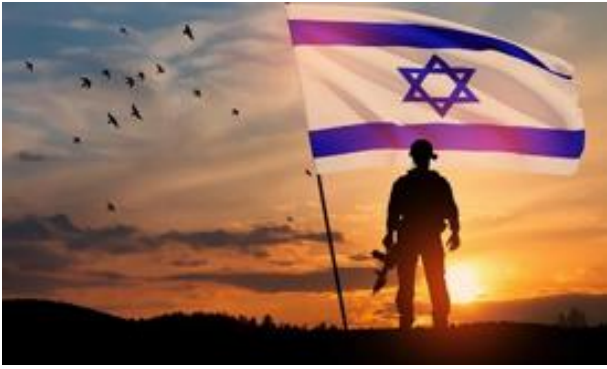
Today, Israel is no longer defenseless.

But exactly that seems to be the problem for many!