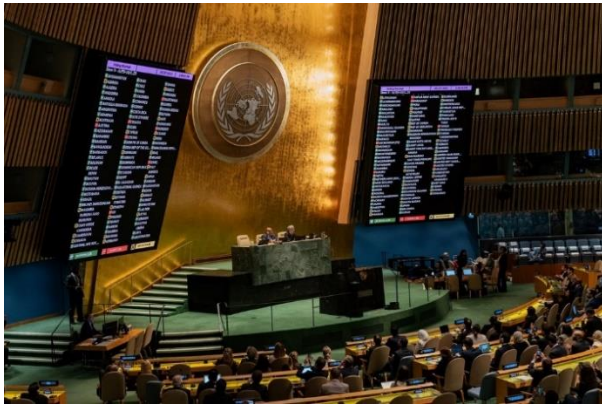
The UN and its institutions adopt resolutions on Israel.

The initial reactions are: shock, expressions of solidarity and visits of condolence. The atrocities are incomprehensible. What happened there, shakes to the core. But as soon as Israel attacks Hamas in the Gaza Strip, other images come to the forefront and the tide turns.