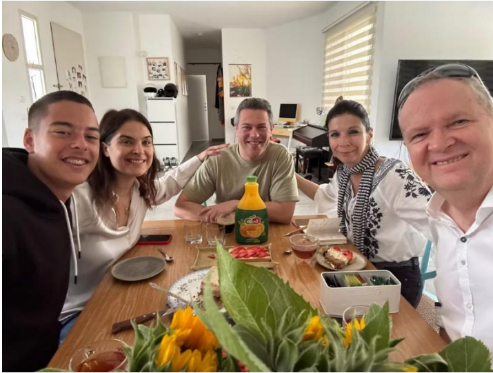
Oasis of hospitality.

We experienced their home in Yated as an oasis of hospitality and a fortress of hope. While many places on the border periphery with Gaza lie in ruins and ashes, they welcomed us with warmth and optimism.