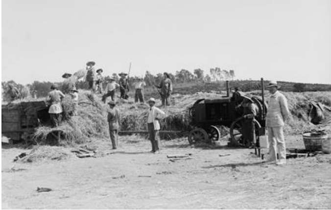
Build-up work in Israel after the founding of the state.

The boycott of Israel by the Arab League, in which third countries are involved as well, also has a negative impact on the economic situation.