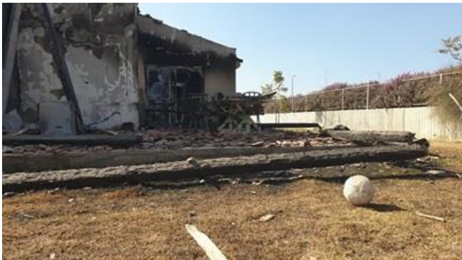
Be'eri, an Israeli kibbutz on the border with Gaza after the attack on October 7.

On October 7, 2023, Hamas terrorists from the Gaza Strip break through the border to Israel at dawn. They destroy over 20 Israeli towns and villages and cause a terrible bloodbath. They kidnap over 230 hostages and abuse, torture and murder over one thousand four hundred Jewish civilians. Only then are they stopped by the Israeli armed forces xix .