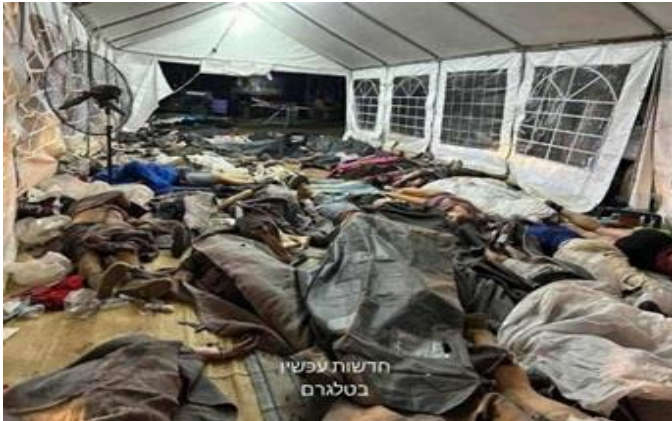
Israeli victims of the attack on October 7, 2023.

The "Al Aksa Flood", as Hamas called the operation, was actually planned as a "deluge" that would flood the entire country, kill all Jews and liberate the Al Aksa Mosque in Jerusalem. The atrocities committed by the terrorists are indescribable. Even three weeks later, not all of the partially dismembered and burnt Israeli bodies have been identified. (More information on these websites: https://govextra.gov.il/mda/october-7/october-7/what-happened-on-the-7th-of-october/ ; https://saturday-october-seven.com/#/ )