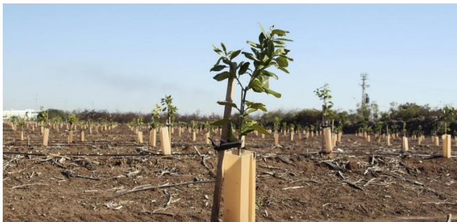
Drip irrigation in the desert.

Every drop is managed. Irrigation is computer-controlled through hoses. Leak detectors ensure that losses are quickly detected and rectified.