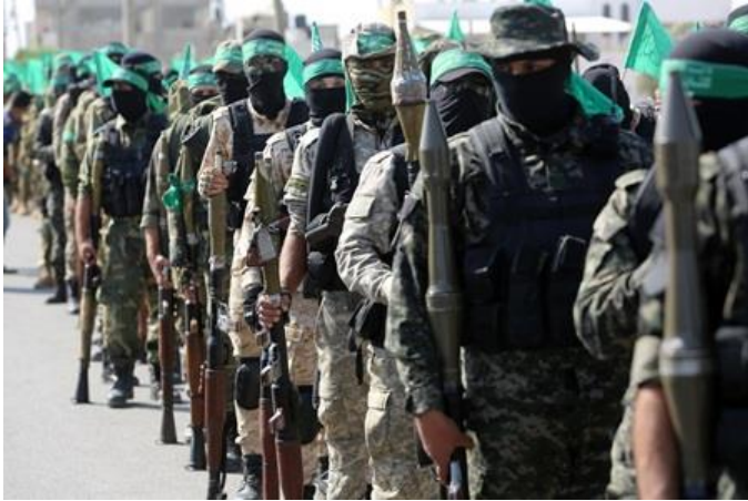
Threats from terrorist organizations.

However, terrorist attacks have claimed hundreds of lives since the 1990's. In response, Israel begins to erect barriers. Nine-meter-high walls separate the Arab towns, from which most attacks originate, from Jewish towns. As a result, the number of terrorist attacks actually decreases.