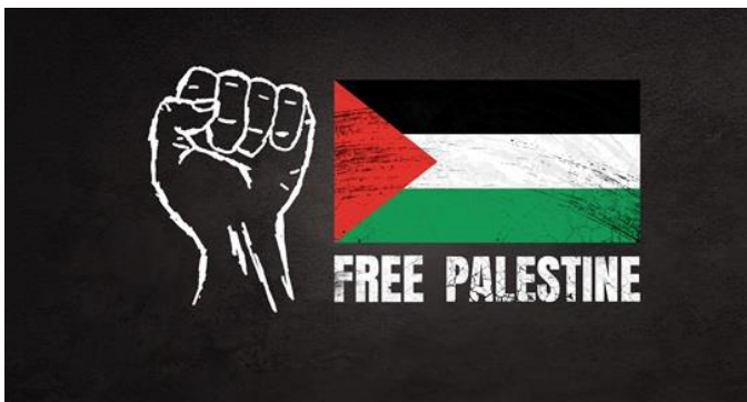
New dimension in the Israeli-Palestinian conflict.

For the Israelis, the unexpectedly quick victory is like a miracle, a gift from God (see movie Against All Odds ). And a milestone, a turning point in Israel's history. Jerusalem becomes the eternal and undivided capital of Israel. Jews, who were expelled from Judea and Samaria during the War of Independence return and begin to rebuild the settlements, that were destroyed at the time, such as Gush Etzion . The Israeli economy flourishes.