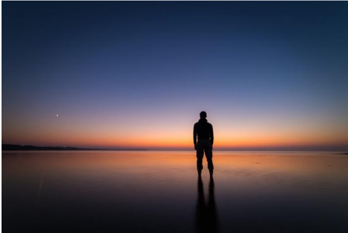
Every individual can make a difference.

Both in history and in the Bible, we repeatedly encounter situations where Israel, where Jerusalem has to stand alone against the rest of the world. "For all the nations of the earth will be gathered against Jerusalem." (Zechariah 12:3)