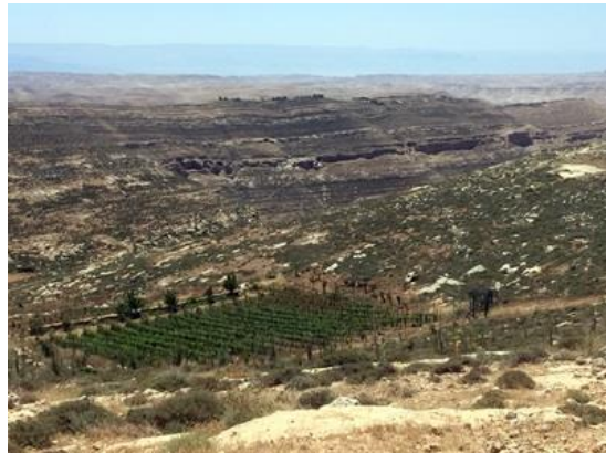
Gardens in the Judean Desert