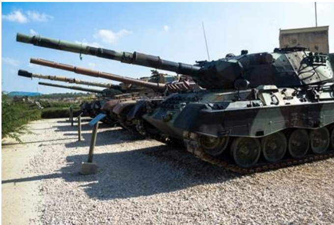
Captured tanks from the Yom Kippur War.

The next blow follows soon after. On October 6, 1973, on Yom Kippur, Israel is completely surprised. Egypt crosses the Suez Canal and attacks from the air, while Syria moves in with 1,400 tanks in the north (see Golan Heights - Valley of Tears). The situation is desperate. Israel has difficulties mobilizing its armed forces, because everything is at a standstill on the highest Jewish holiday. Radio and television are off the air and people spend the day in prayer.