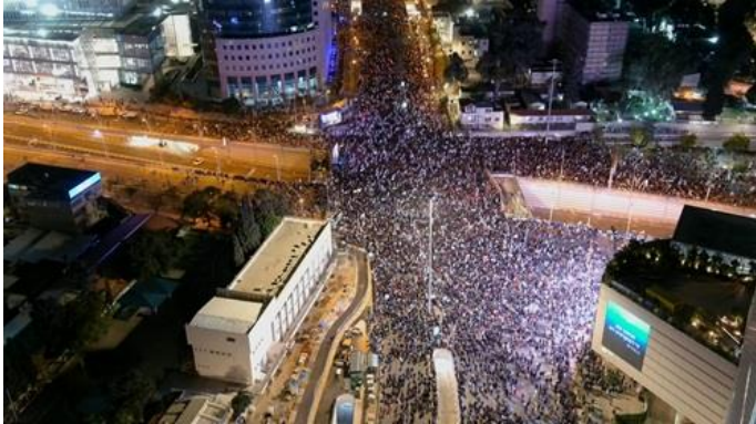
Demonstrations in Tel Aviv 2023.

But in 2023, Israel will also experience the greatest internal division since its founding.