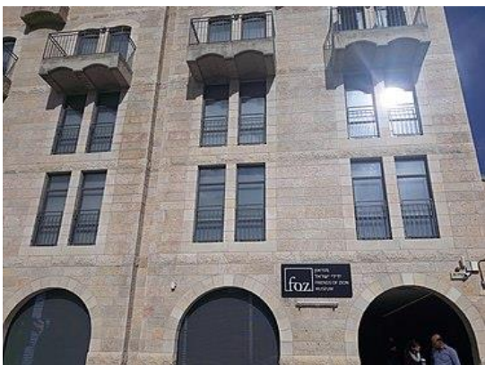
The Friends of Zion Museum in Jerusalem

But at all times there have also been extraordinary women and men, who saw it as their task, to be a blessing for Jews and Israel. They were prepared to risk their lives, to contribute to the miracle of Israel (see article: Blessed be Everyone, who Blesses You, Israel! ). The Friends of Zion Museum in Jerusalem tells many of their impressive stories and at the Yad Vashem Holocaust Memorial they are honored as Righteous of the Nations.