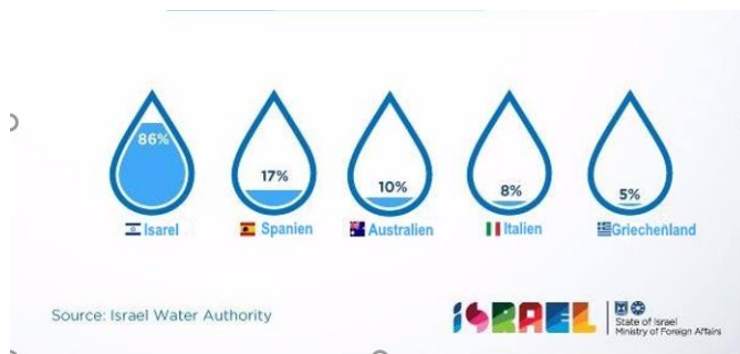
Israel recycles the most wastewater in the world. Statistics Ministry of Foreign Affairs Israel

With their innovative strength, they create solutions for the impossible. For example, Israel is the only country where the desert is shrinking. They use water desalination plants to turn water from the Mediterranean into drinking water. In addition, 86% of wastewater is recycled and reused in agriculture.