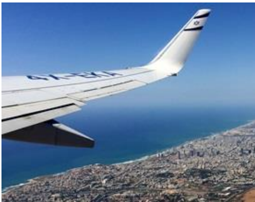
Tel Aviv today, a lively cosmopolitan metropolis

"They will rebuild and inhabit the desolate cities, plant vineyards and drink their wine, plant gardens and enjoy their fruit." (Amos 9:14).