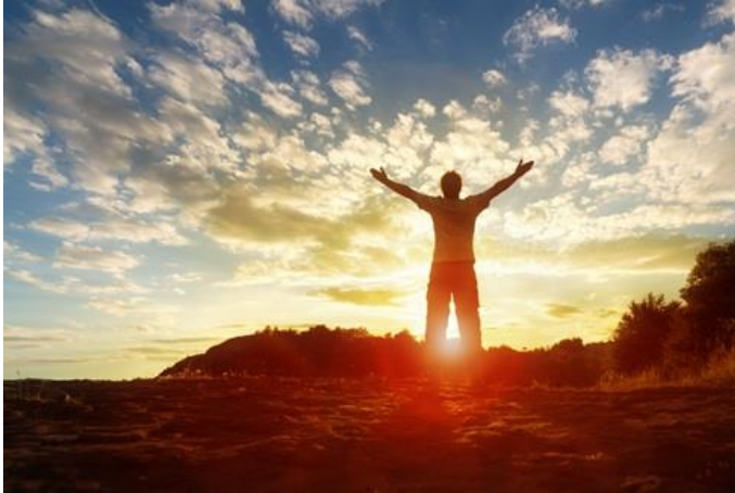
The zest for life of the Israelis is impressive.

But despite all the shadows, many biblical promises have been fulfilled in the years since the state was founded (see article: How We Experienced the Miracle Israel ). "They say, that our bones are withered and our hope is lost. But thus says God: I will open your graves and bring you back to life, my people, and I will bring you into the land of Israel." (Ezekiel 37:3,11-12)