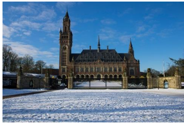
International Court of Justice, Peace Palace, The Hague

UN resolutions demand a ceasefire and humanitarian aid from Israel for the Gaza Strip, without condemning the Hamas massacre. In addition, in January Israel is being indicted by South Africa before the International Court of Justice in The Hague. Israel's fight against the terrorist Hamas is not seen as self-defense, but as genocide by them. The USA and other states consider unilaterally recognizing a Palestinian state without Israel's consent. International pressure is mounting. (See also articles: The Second Chance and Never Again – a Solid Promise? )