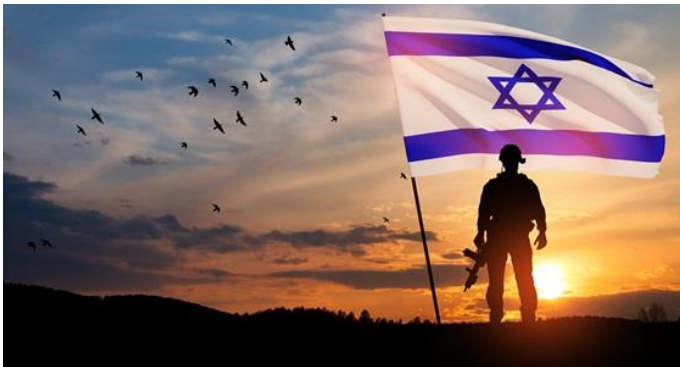
Military stroke of genius or divine miracle: the Six-Day War.

But then the next war looms. In the spring of 1967, Egypt closes the Strait of Tiran to Israeli shipping, forces the withdrawal of UNEF troops from the Sinai and marches up to Israel's border with 1,000 tanks and almost 100,000 soldiers. Northern Israeli settlements are attacked from the Syrian Golan Heights. Syrian President Nureddin al-Atassi declares as early as 1966: "We want a total war without restrictions, a war that will destroy the Zionist base." Egypt's President Gamal Abdel Nasser agrees: "Our fundamental goal is the destruction of Israel. The Arab people want to fight."