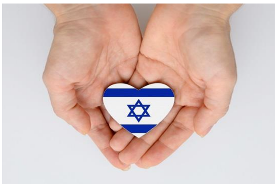
Are we ready to be a blessing for Israel?