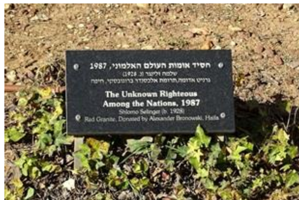
The righteous are honored at Yad Vashem.