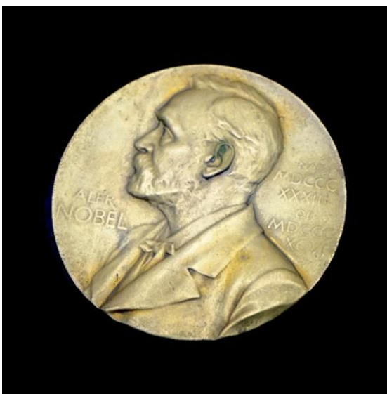
The Nobel Prize: honoring the most worthy.