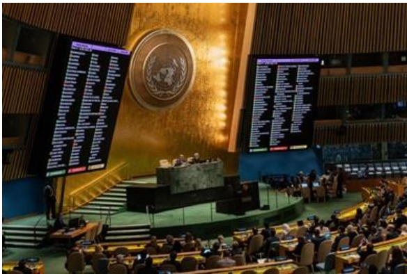
UN resolution October 2023.

The support, that Israel receives from the world, decreases with each passing day. The country is suffering from the trauma of the invasion and the losses in the war. It is being downgraded by rating agencies, the economy is staggering, crops cannot be harvested because over 300,000 reservists are fighting on the front line for months and thousands of guest workers have left the country.